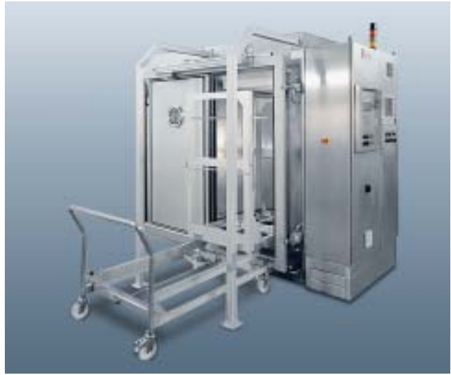
Vacuum heating and drying oven – Microwave-heated design available as option