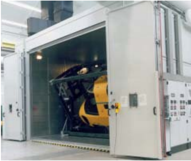
Recirculation air tempering oven with mobile rotating frame for CFRP helicopter cockpits