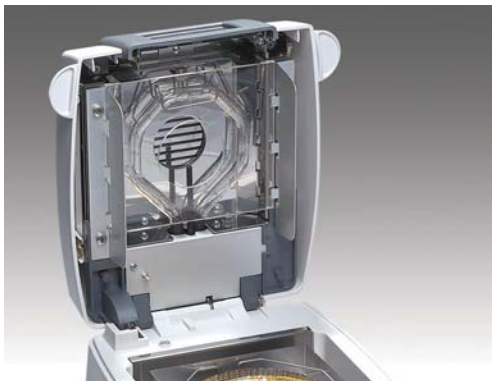
3 different radiation heat sources are optional