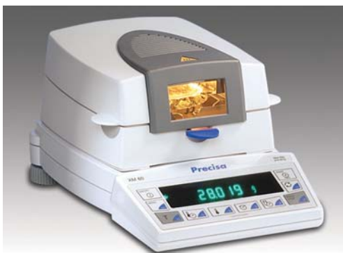
Robust and simple to operate