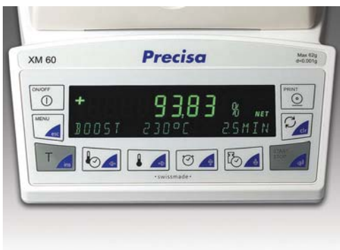
Menu-driven, screen-guided applications