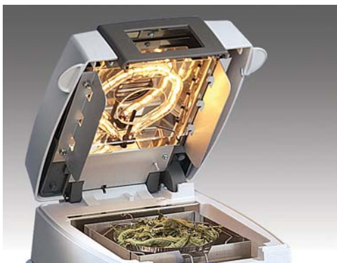
Easy sample access