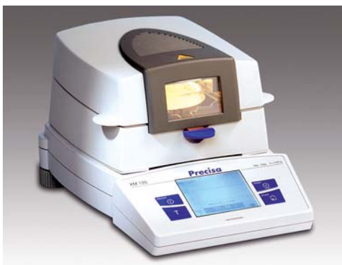
Compactly styled design