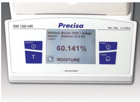
Outstanding Touch Screen Display